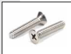
Phillips Flat Machine Screws 113-114