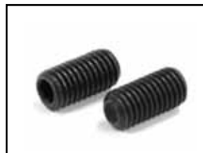
Set Screws 122-123