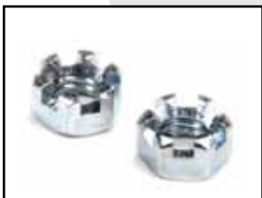
Castle Nuts 109